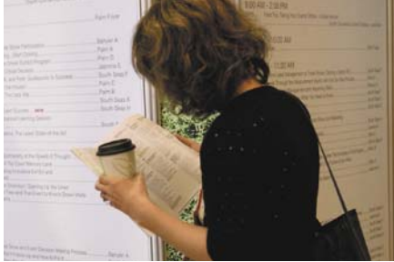
Exhibit hall visitors depend on the Official Show Directory Addendum for last minute additions, changes and final floor plan with all exhibitors' locations. It remains with the directory, going from the exhibit hall back to the office for reference after the show.