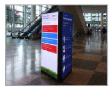
LED Displays/Digital Signage