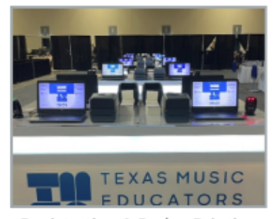
Registration & Badge Printing

From booth to ballroom and everything in between, we can help turn your vision into reality.