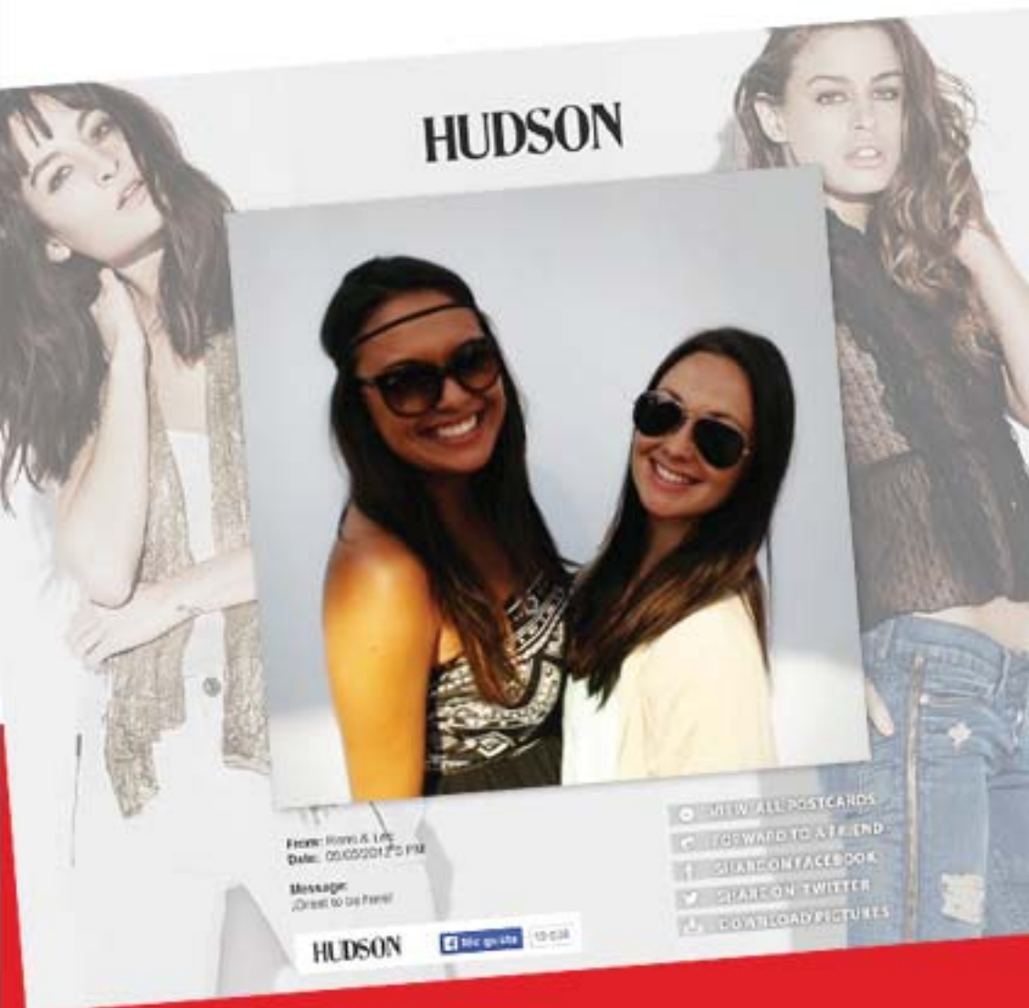
Customized Postcard & Photo album