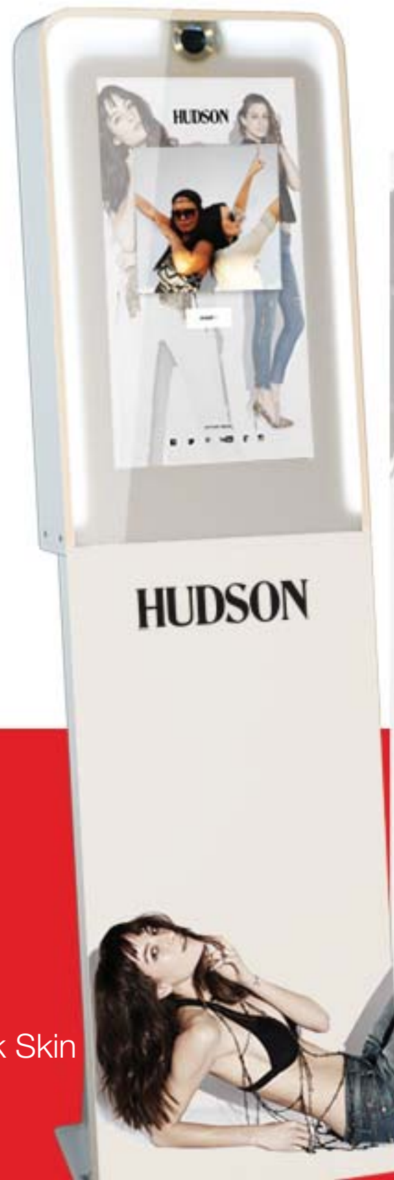
Customized Kiosk Skin