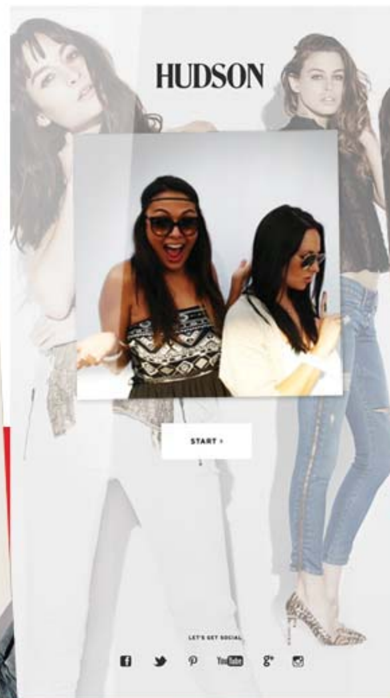
Customized User Interface